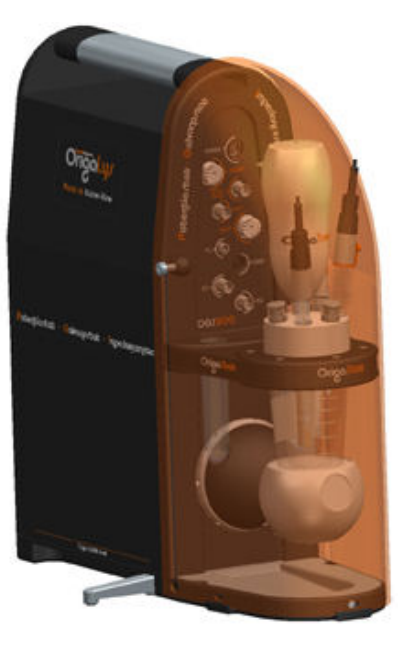
Figure 6: Cover the cell