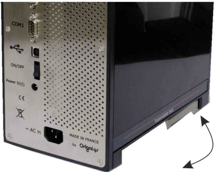
Figure 1: Foot legs

Your OGS200 Electrochemical system is fitted with 2 lateral fold out foots providing a safe stability of the whole instrument. Put these 2 fold out foots in place before installing the electrochemical cell.