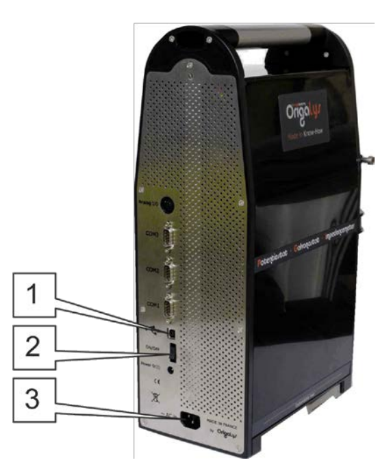
Figure 7: Connecting OGS 200 to the PC

Connect the USB socket (ref. 1) on the OGS200 to an USB port on the PC using a standard USB 2.0 cable.