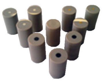
Figure 5: Electrode tips

Supplied with no tips in standard version, the OrigaTrod Rotating electrode is available with a wide range of OrigaLys active tips in various materials and diameters (see table below). It can also be equipped with M6 compatible tips.